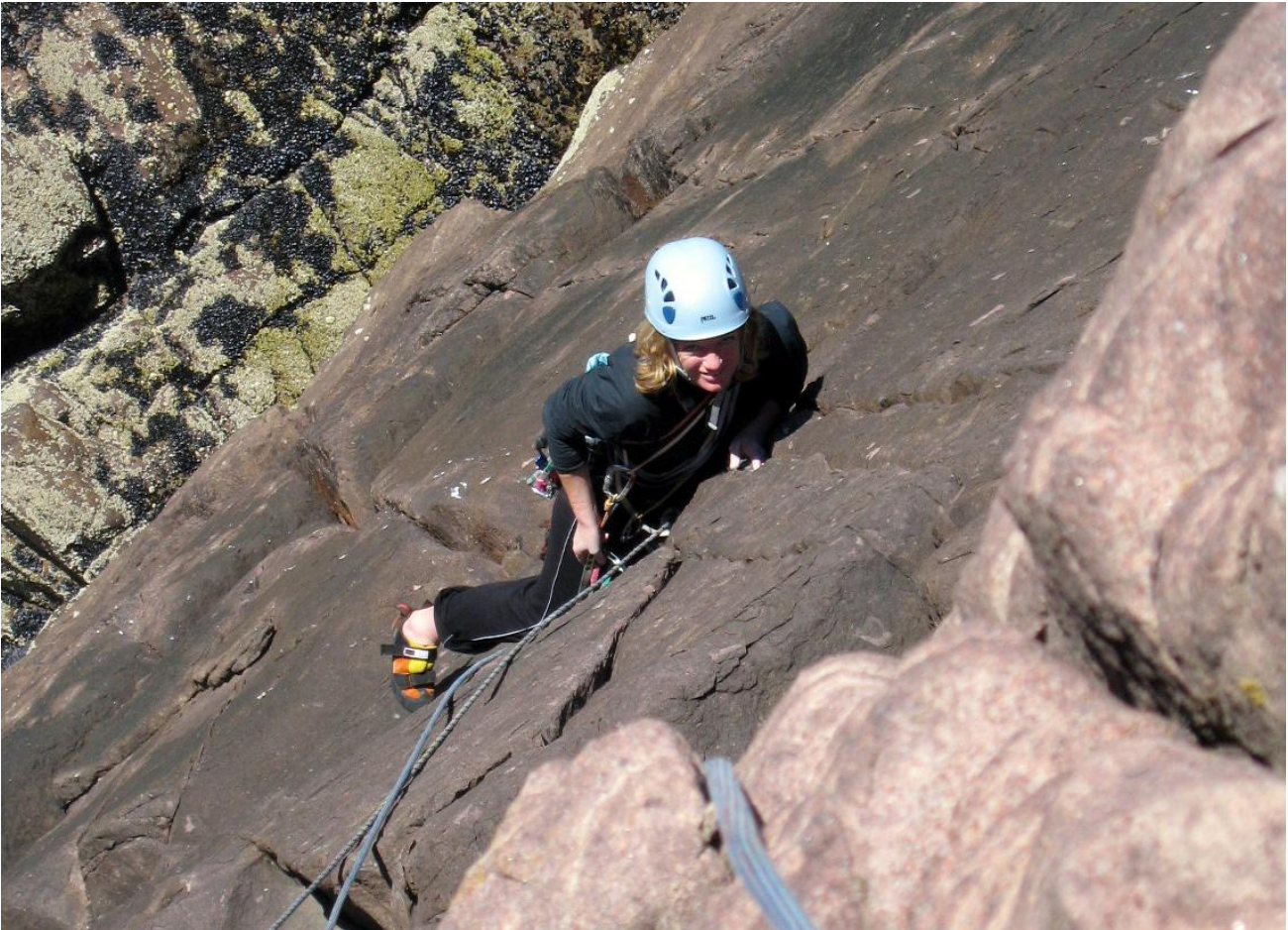
Pitch 1 on the Old Man of Stoer