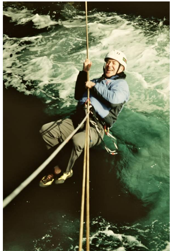
Tyrolean traverse on the Old Man of Stoer

The descent is by one long abseil directly back to the Tyrolean ledge.