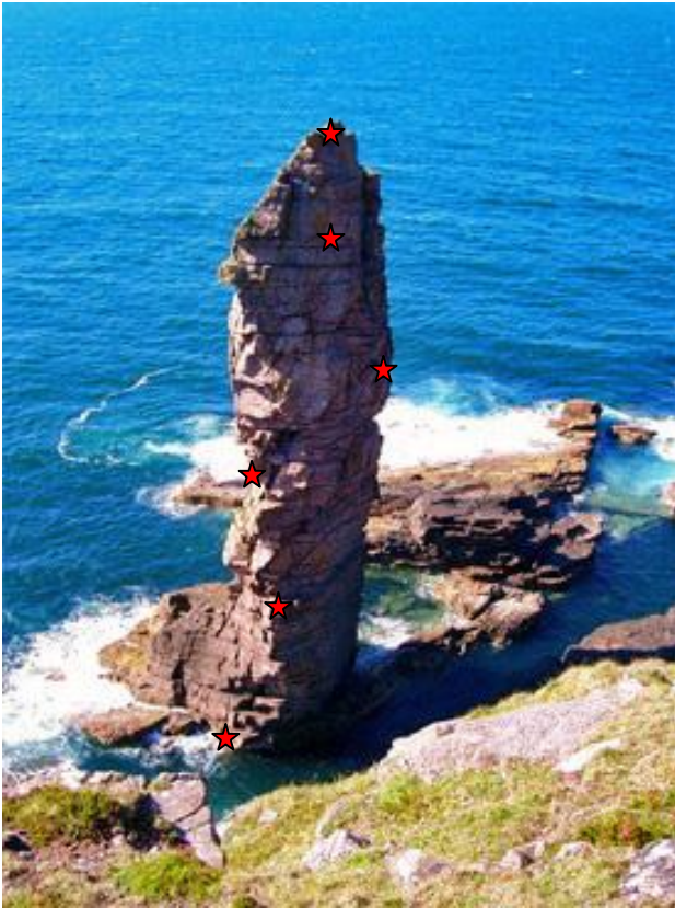
Old Man of Stoer with belays marked