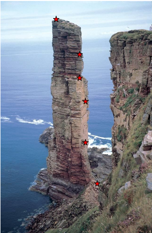
Old Man of Hoy with belays marked