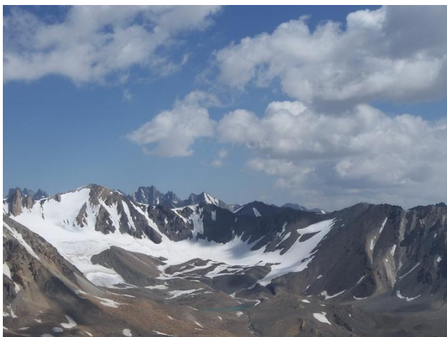
At-Bashy Mountain Range

You should be confident on Scottish Grade 2/3 (Alpine AD/D) ground, and have some previous experience of Alpine Terrain. All unclimbed peaks have a degree of uncertainty and unknown difficulty. Ours will be selected as ones suitable for Scottish grade 2/3 climbers. The peaks are likely to involve a variety of different mountaineering terrain. It is important that participants have a good level of fitness and, where possible, you are encouraged to attend some of the pre-expedition meets.